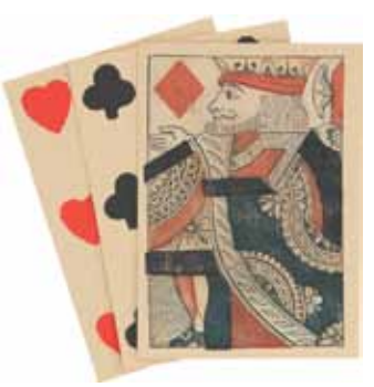
#Cards-18C Playing cards from the 1770's $4.99