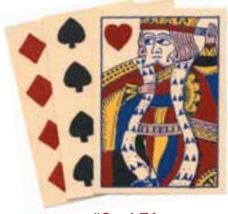
#Card-EA Early American playing cards $6.99