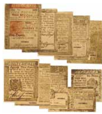
#Money-Set-BF Ben Franklin money set $1.20