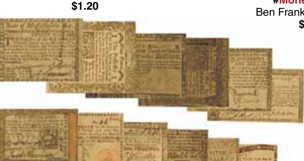
#Money-Set-13 13 States money set $1.20