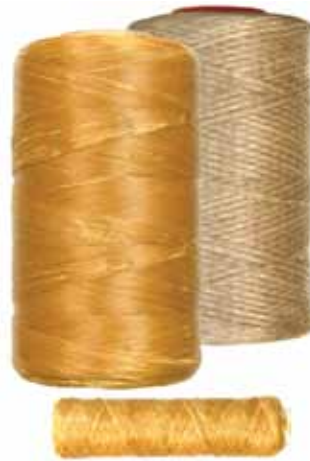
Artificial Sinew, waxed nylon, (Not shown to scale)

We are closed Saturdays and Sundays 763-633-2500