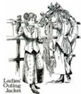
Ladies Outing Jacket

#Pattern-C Detachable Collars pattern $3.50