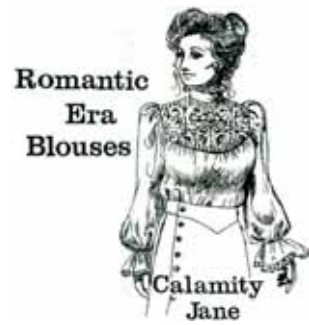
Romantic Era Blouses

#Pattern-LOJ Ladies Outing Jacket pattern $15.99