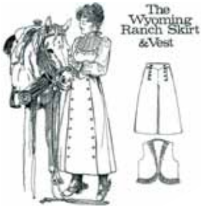
The Wyoming Ranch Skirt & Vest