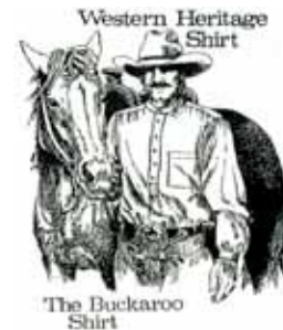
The Buckaroo Shirt