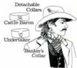
Detachable Collars Cattle Baron Undertaker Banker's Collar

#Pattern-WRS Ranch Skirt & Vest pattern $13.99