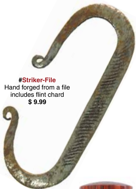
#Striker-File Hand forged from a file includes flint chard $ 9.99