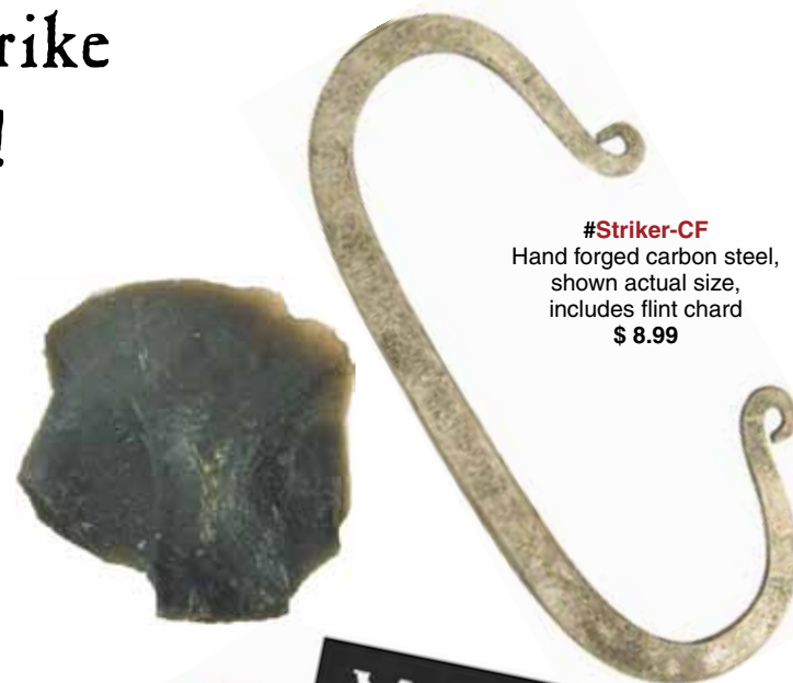
#Striker-CF Hand forged carbon steel, shown actual size, includes flint chard $ 8.99