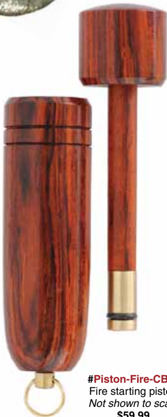
#Piston-Fire-CB-S Fire starting piston Not shown to scale $59.99

#Piston-Fire-CB-S Coco Bolo piston fire starter only $59.99