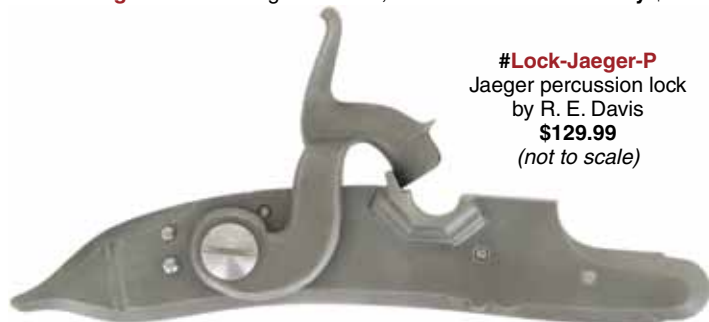
#Lock-Jaeger-P Jaeger percussion lock by R. E. Davis $129.99 (not to scale)

#Lock-Jaeger-C Jaeger flint lock, wide flat cock only $134.99