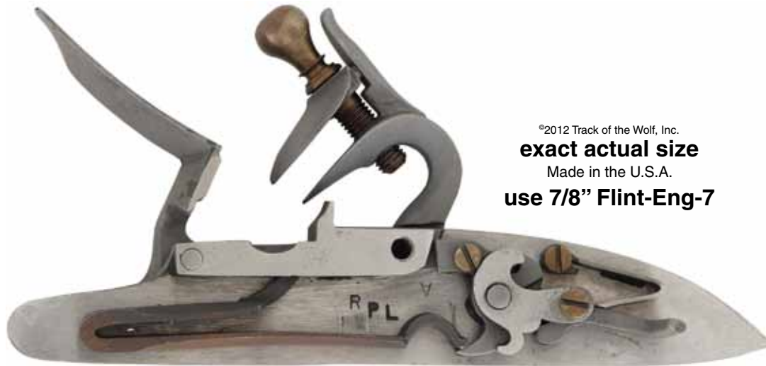
©2012 Track of the Wolf, Inc. exact actual size Made in the U.S.A. use 7/8" Flint-Eng-7

We can supply an appropriate nipple, nipple wrench, and other parts you may require. We stock repair parts for L&R locks. #Lock-LR-05-F flint lock, Lyman Great Plains rifle only $148.00 #Lock-LR-05-C cap lock, Lyman Great Plains rifle only $112.00 #Bolt-LR-05 lock bolt, Lyman Great Plains rifle only $ 2.99