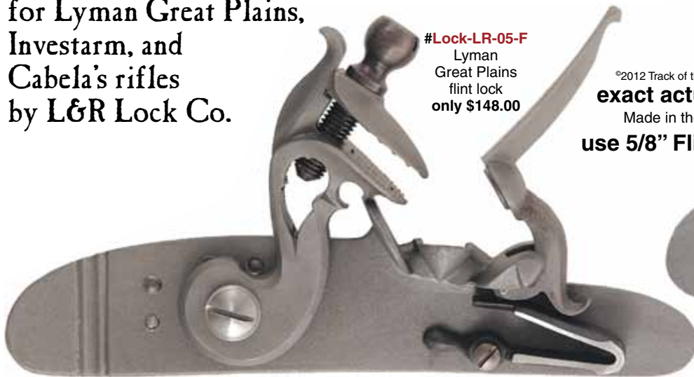
#Lock-LR-05-F Lyman Great Plains flint lock only $148.00

©2012 Track of the Wolf, Inc. exact actual size Made in the U.S.A. use 5/8" Flint-Eng-5