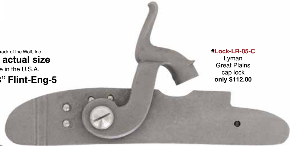
#Lock-LR-05-C Lyman Great Plains cap lock only $112.00

©2012 Track of the Wolf, Inc. exact actual size Made in the U.S.A. use 5/8" Flint-Eng-5