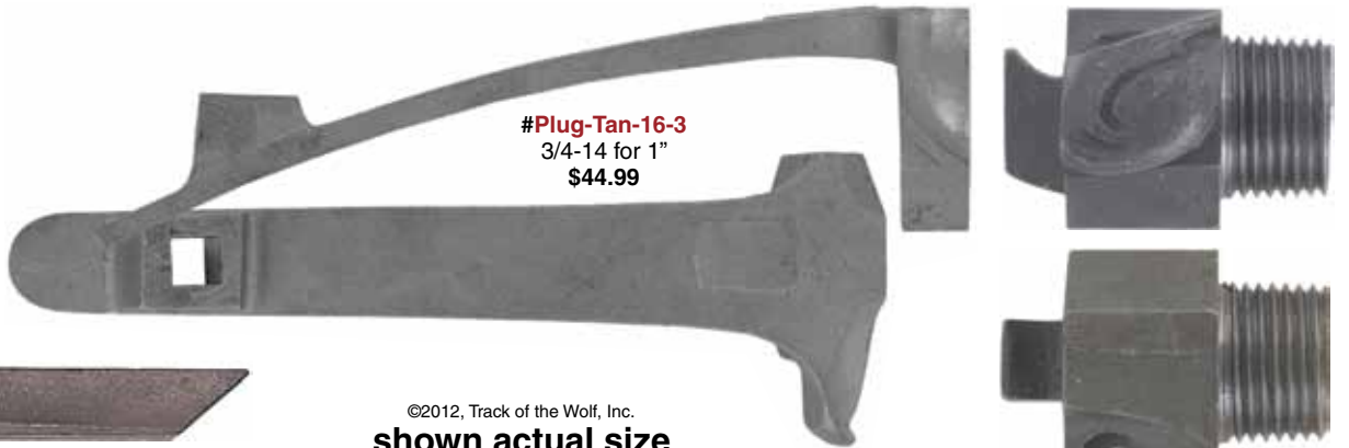
#Plug-Tan-16-3 3/4-16 for 1" $44.99

©2012, Track of the Wolf, Inc. shown actual size Made in the U.S.A.