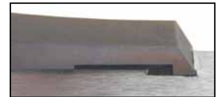
Forming a raised dovetail for a rear sight.

#Tool-Dovetail Dovetail forming tool only $12.99