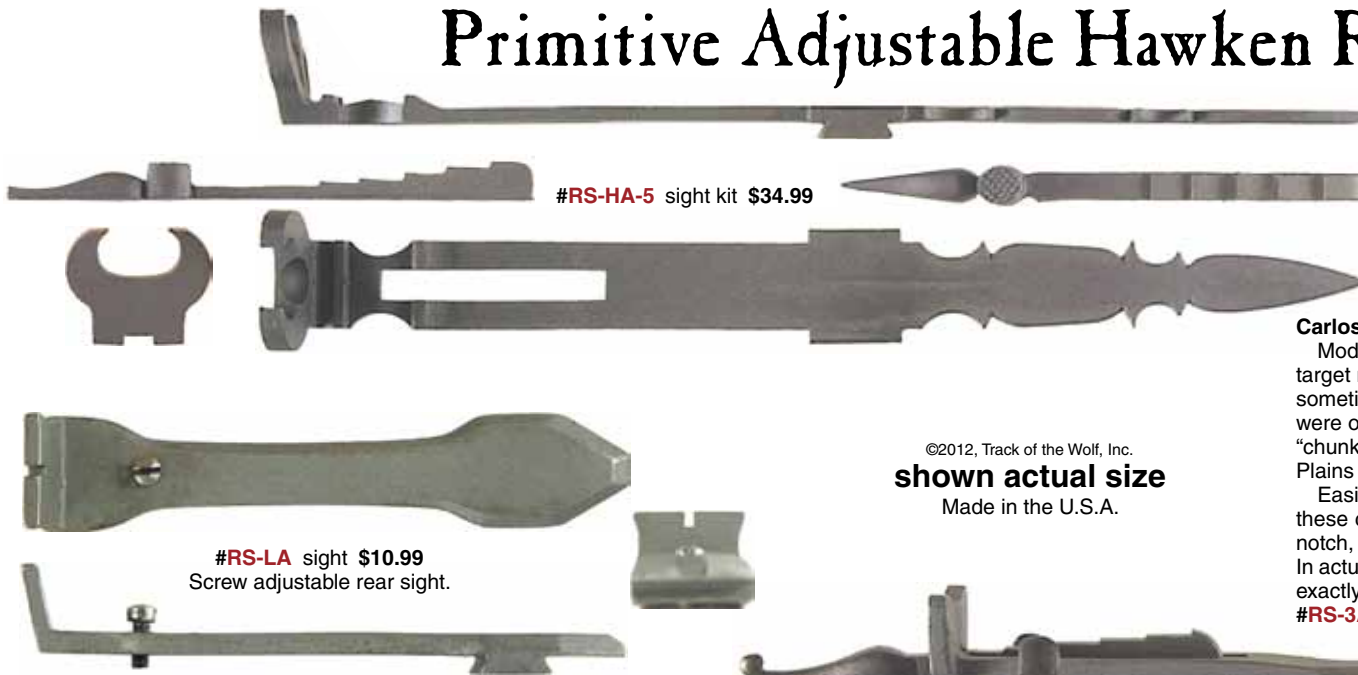
#RS-HA-5 sight kit $34.99