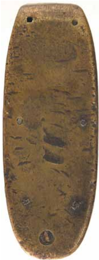
Left A Northwest Trade Gun buttplate attached using 7 nails and 1 screw.