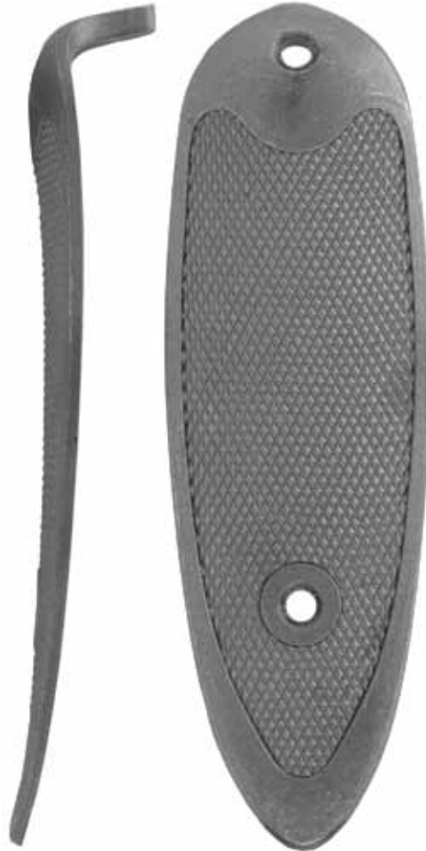
#BP-Shot-C-2-I checkered buttplate iron $21.99

#BP-Eng-C-I buttplate, wax cast steel only $21.99