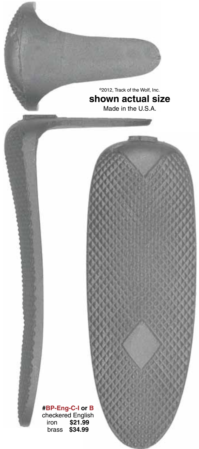
#BP-Eng-C-I or B checkered English iron $21.99 brass $34.99

©2012, Track of the Wolf, Inc. shown actual size Made in the U.S.A.