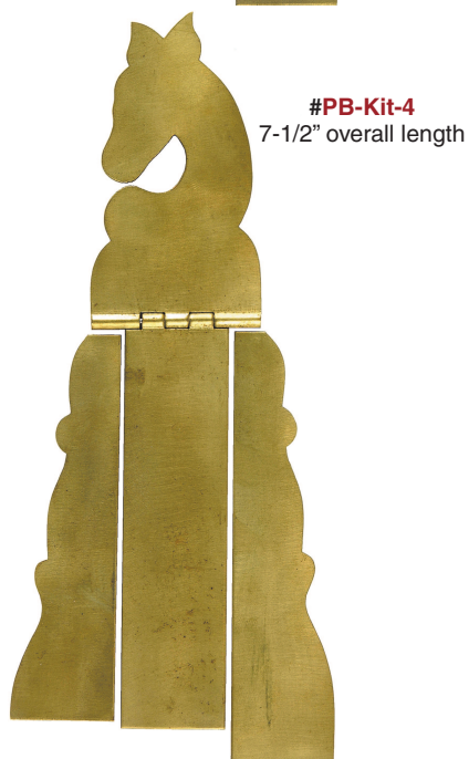
#PB-Kit-4 7-1/2" overall length