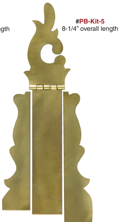
#PB-Kit-5 8-1/4" overall length