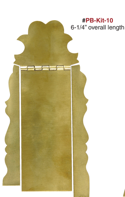
#PB-Kit-10 6-1/4" overall length