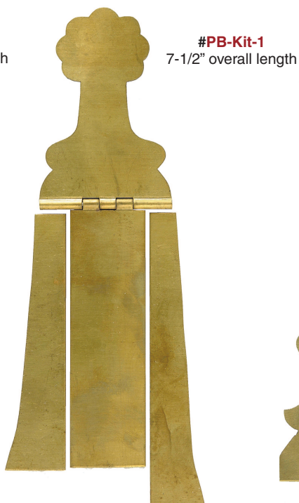
#PB-Kit-1 7-1/2" overall length