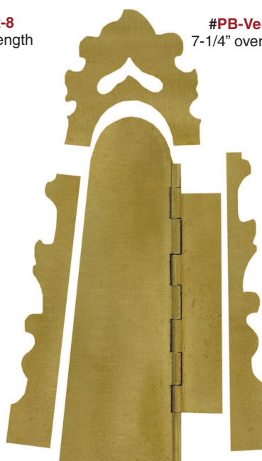
#PB-Verner-B 7-1/4" overall length

Lancaster County Patchbox ..... #PB-Kit-15-B, I, or S Copied from a rifle made and signed by Jacob Metzger, shown in Rifles of Colonial America . Spring and instructions are included. #PB-Kit-15-B patchbox kit, brass only $24.99 #PB-Kit-15-I patchbox kit, iron only $24.99 #PB-Kit-15-S patchbox kit, nickel silver only $30.99