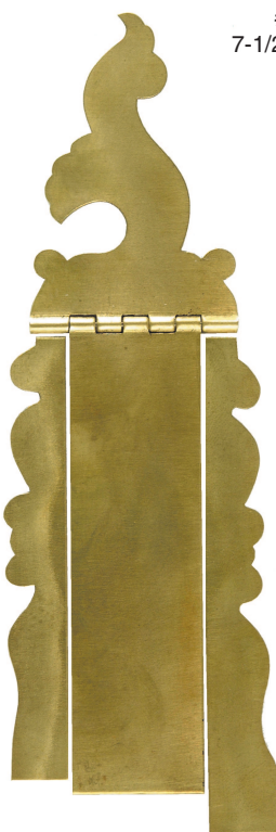
#PB-Kit-11 7-1/2" overall length