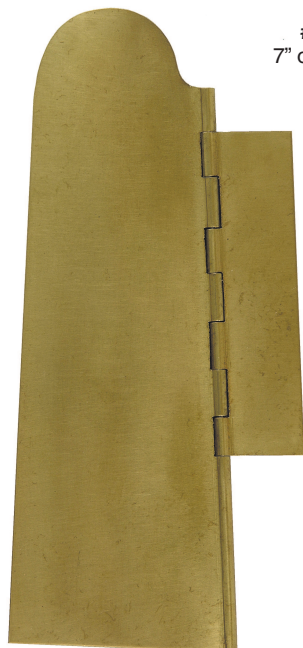
#PB-Kit-8 7" overall length