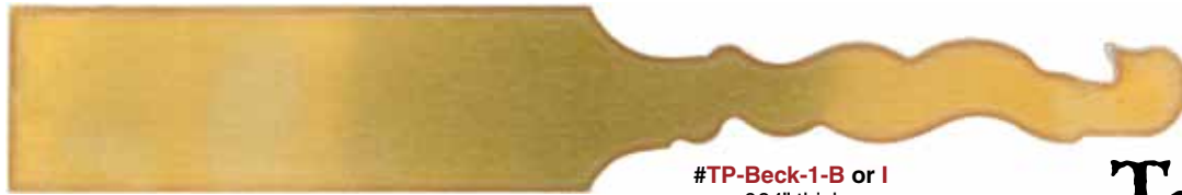
#TP-Beck-1-B or I .064" thick brass or iron