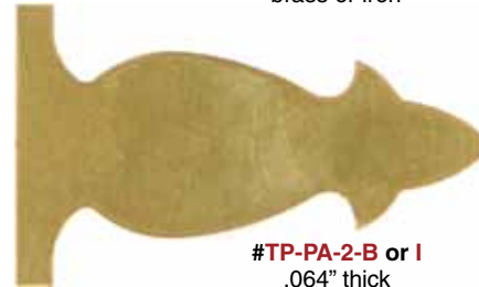
#TP-PA-2-B or I .064" thick brass or iron