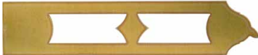
#TP-York-B or I .064" thick brass or iron