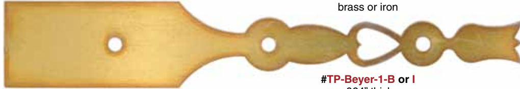
#TP-Beyer-1-B or I .064" thick brass or iron