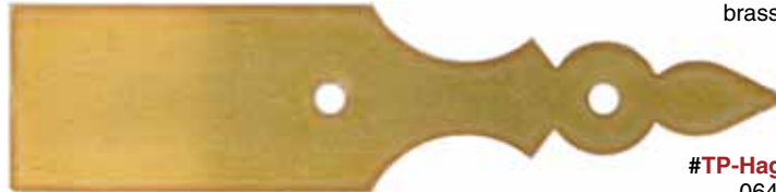
#TP-Haga-1-B or I .064" thick brass or iron