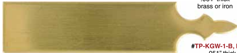
#TP-KGW-1-B, I or S .051" thick brass, steel, or nickel silver