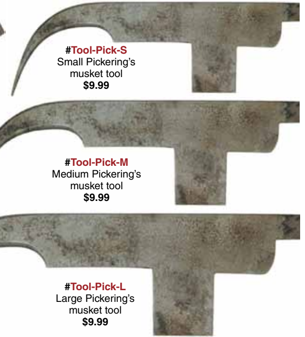
#Tool-Pick-S Small Pickering's musket tool $9.99