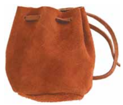
Sueded Leather Ball Bag .....#Bag-Ball-S

Sueded leather ball bag with flat bottom. Draw string closure, this sueded leather bag measures 3-1/2" diameter by 4" tall. #Bag-Ball-S Suede ball bag only $8.99