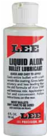
#Lee-Alox Lee liquid alox $5.29

#Lube-One-Shot 16 oz bottle with sprayer only $11.99