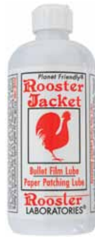
#Lube-Jacket Rooster bullet lube $12.95