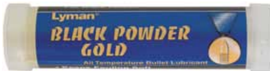
#Lube-Gold Lyman Gold ube $4.50