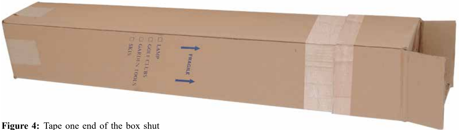
Figure 4: Tape one end of the box shut with strong packing tape. Pad the end of the box with bubble wrap to protect the butt. Foam insulation sheets cut to size works nicely. Place the firearm in the center of the box along with your contact information and fill in the space around it with bubble wrap. Pad the other end of the box with bubble wrap and tape the end shut with packing tape.